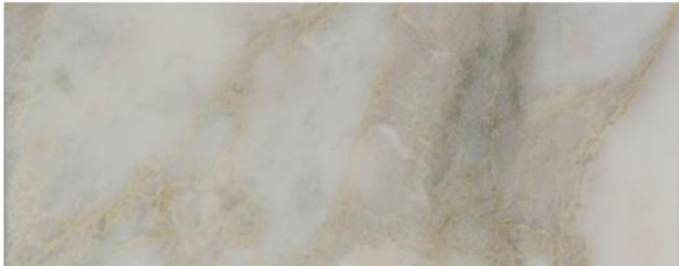
Calacatta Oro Levigato