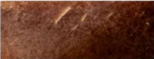
Volterra Brown Alabaster