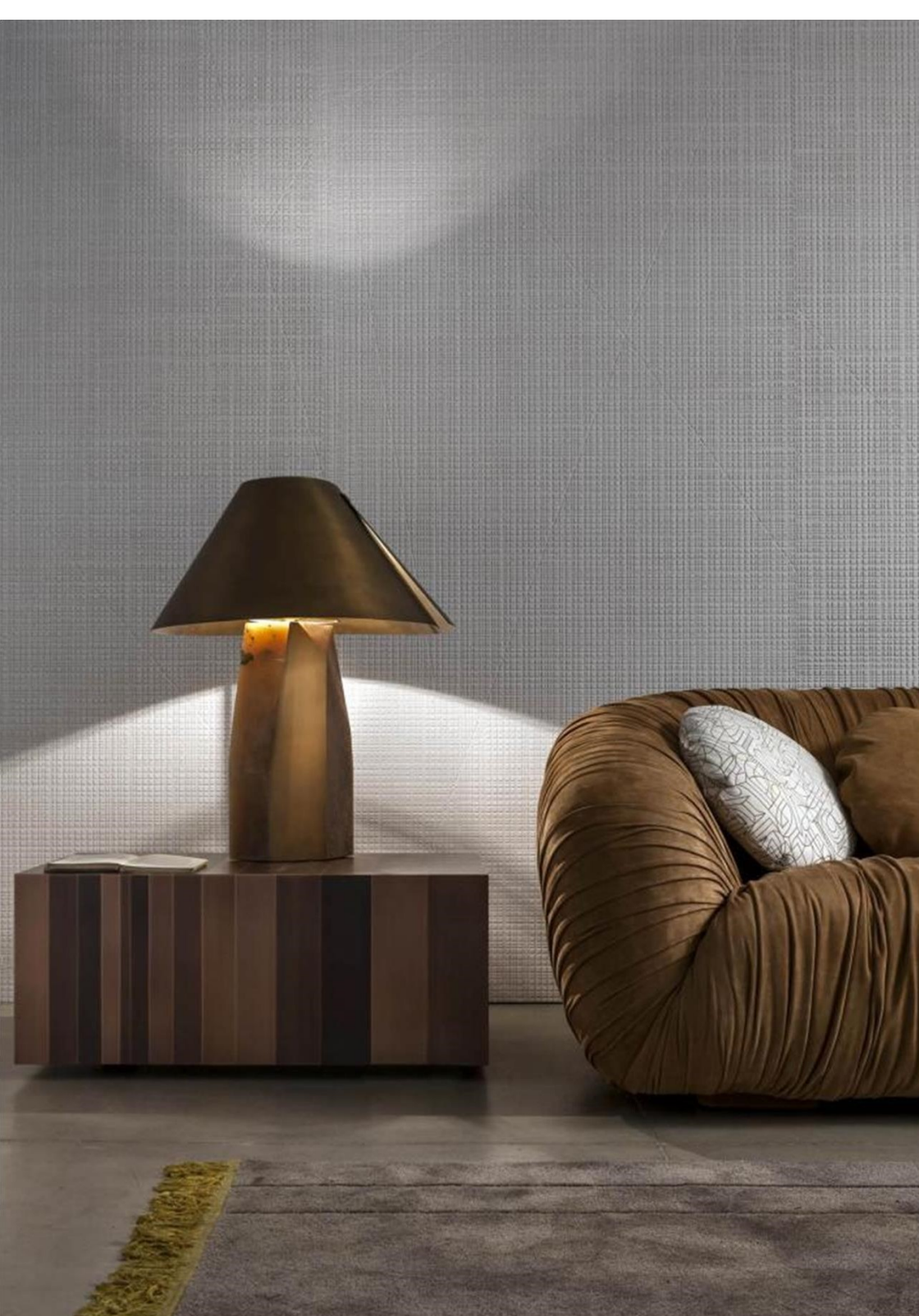
Table lamp with Alabaster base and brass lampshade.

Ada is a sculptural table lamp that combines a typically Italian material with ancient origins such as the Alabaster with satin burnished brass.