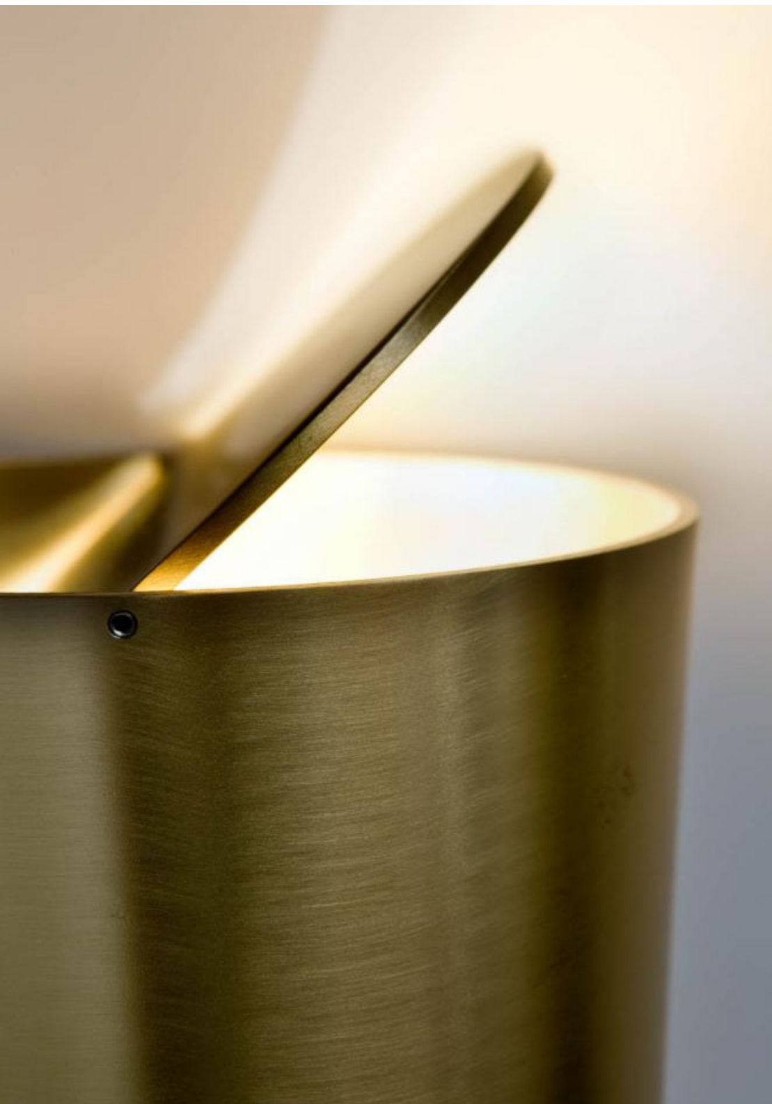
Table lamp with structure in satin natural brass and adjustable upper disc.

MF 35 is a lamp designed to be placed in both houses and offices.