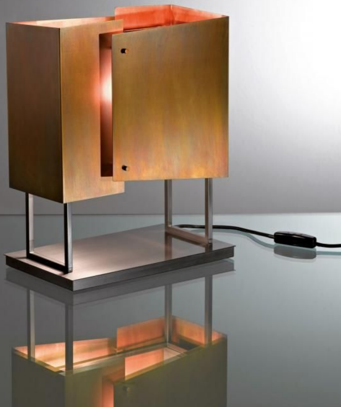
Table Lamp with structure in black nickel brass and shades elements in burnished brass.

This lamp was born with the purpose of offering an original lighting element, perfect to be used in elegant internal spaces.