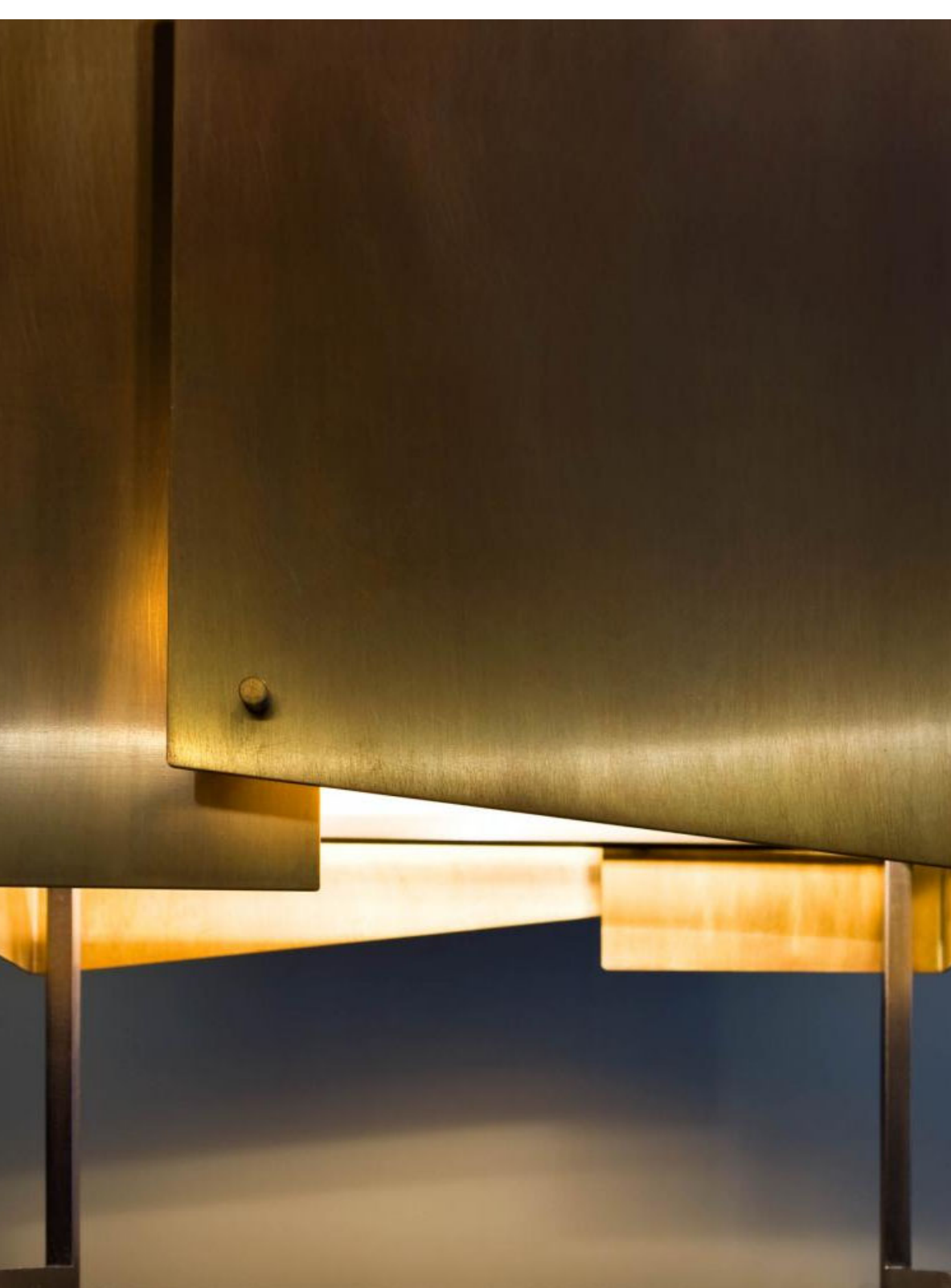
Table Lamp with structure in black nickel brass and shades elements in burnished brass.

This lamp was born with the purpose of offering an original lighting element, perfect to be used in elegant internal spaces.