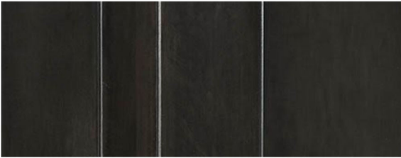
Black Iron "Cenere"