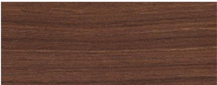
Dyed Walnut Canaletto