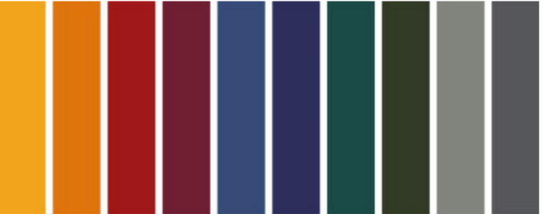
Available in all RAL Colours