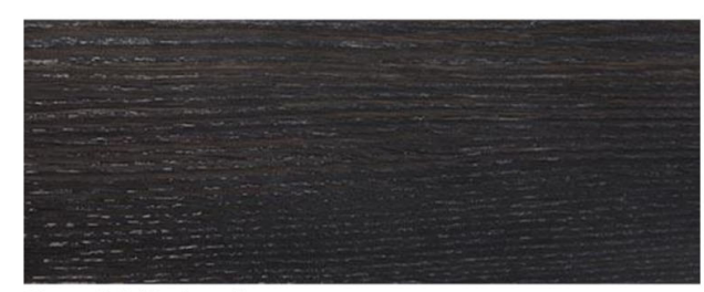
Stone Oak "Carbone"