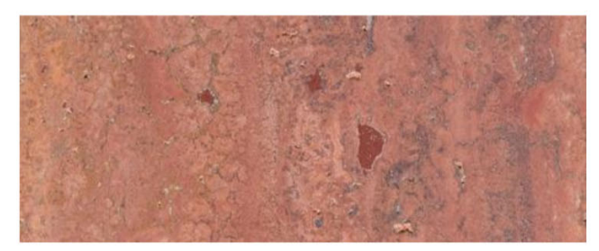
Travertino Rosso Levigato