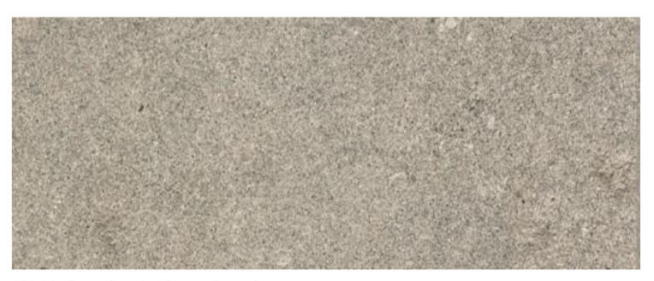
Grigio Ash Levigato